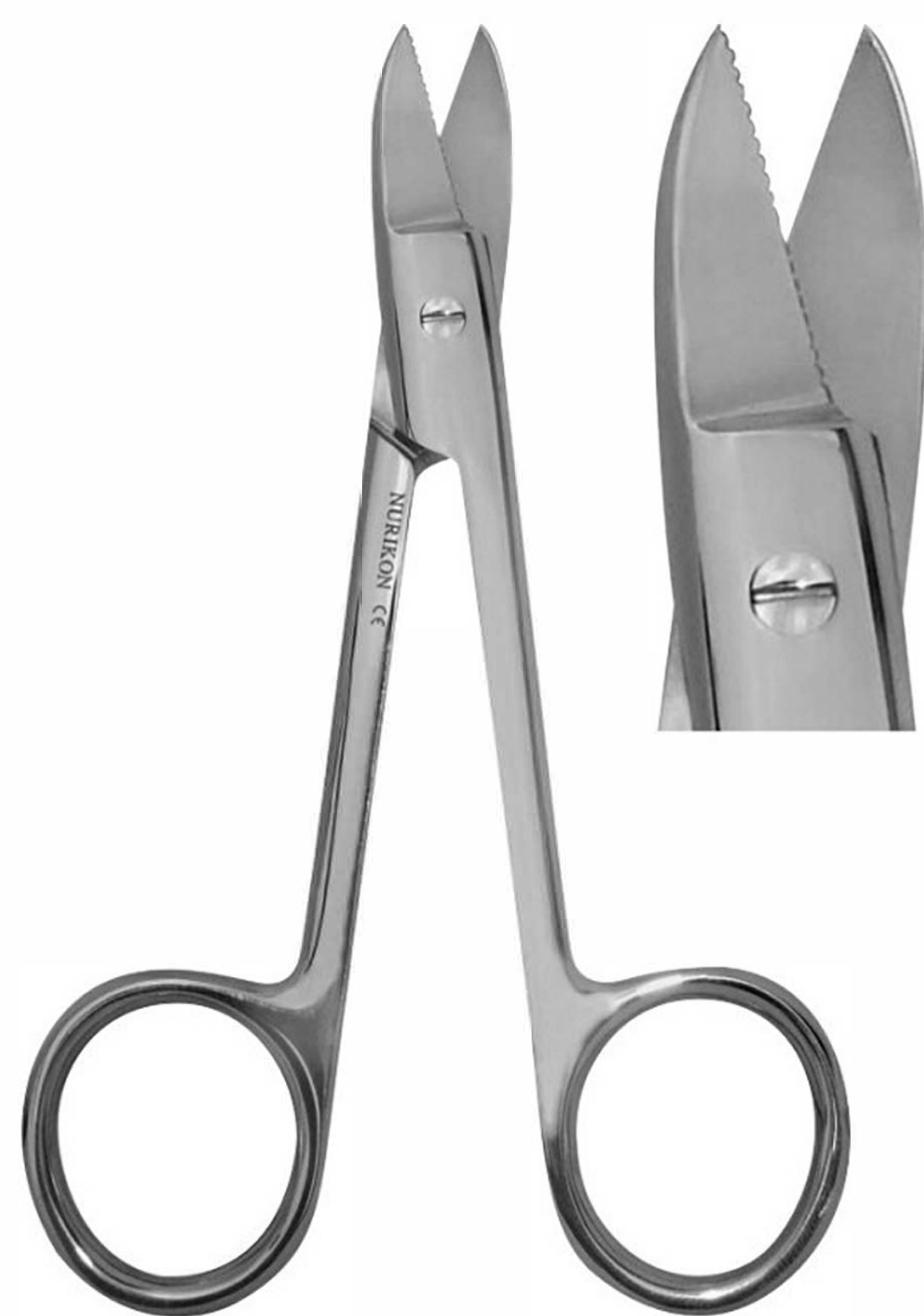
Serrated Trimming Scissors - NK-279