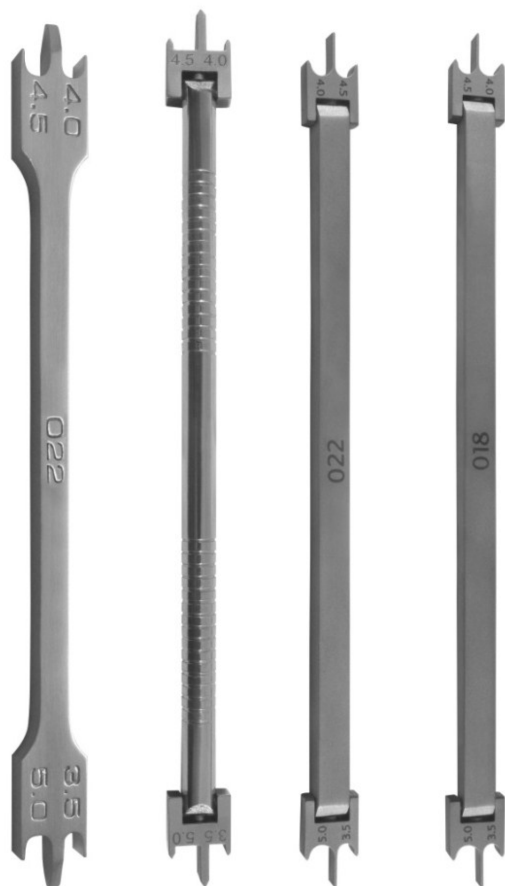
NK-333-A Height Gauge Adjustable