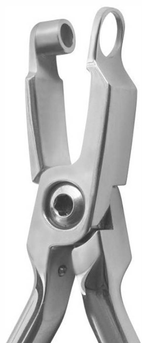
Circular Thermal Forming Plier NK-272 C