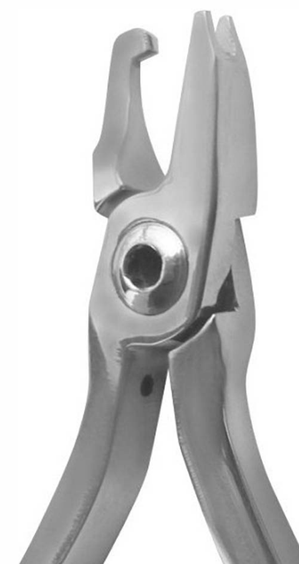
Multi Indent Forming Plier NK-271 D