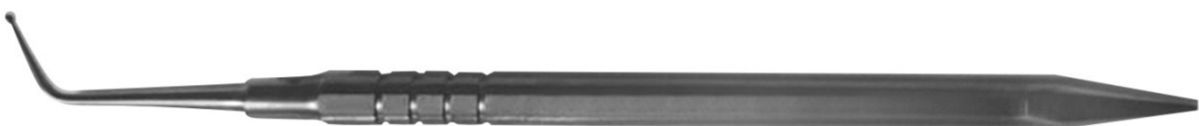
NK-402 Self Ligating Tool

This is Cfast's self ligating too to be used with the self ligating brackets.