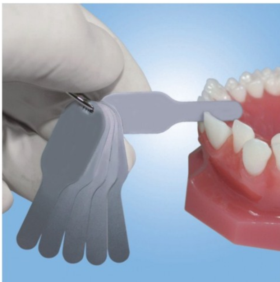
NK-333-C IPR (Interproximal reduction)

Gauge Set Used during Interproximal Reduction (IPR) to measure and confirm space.