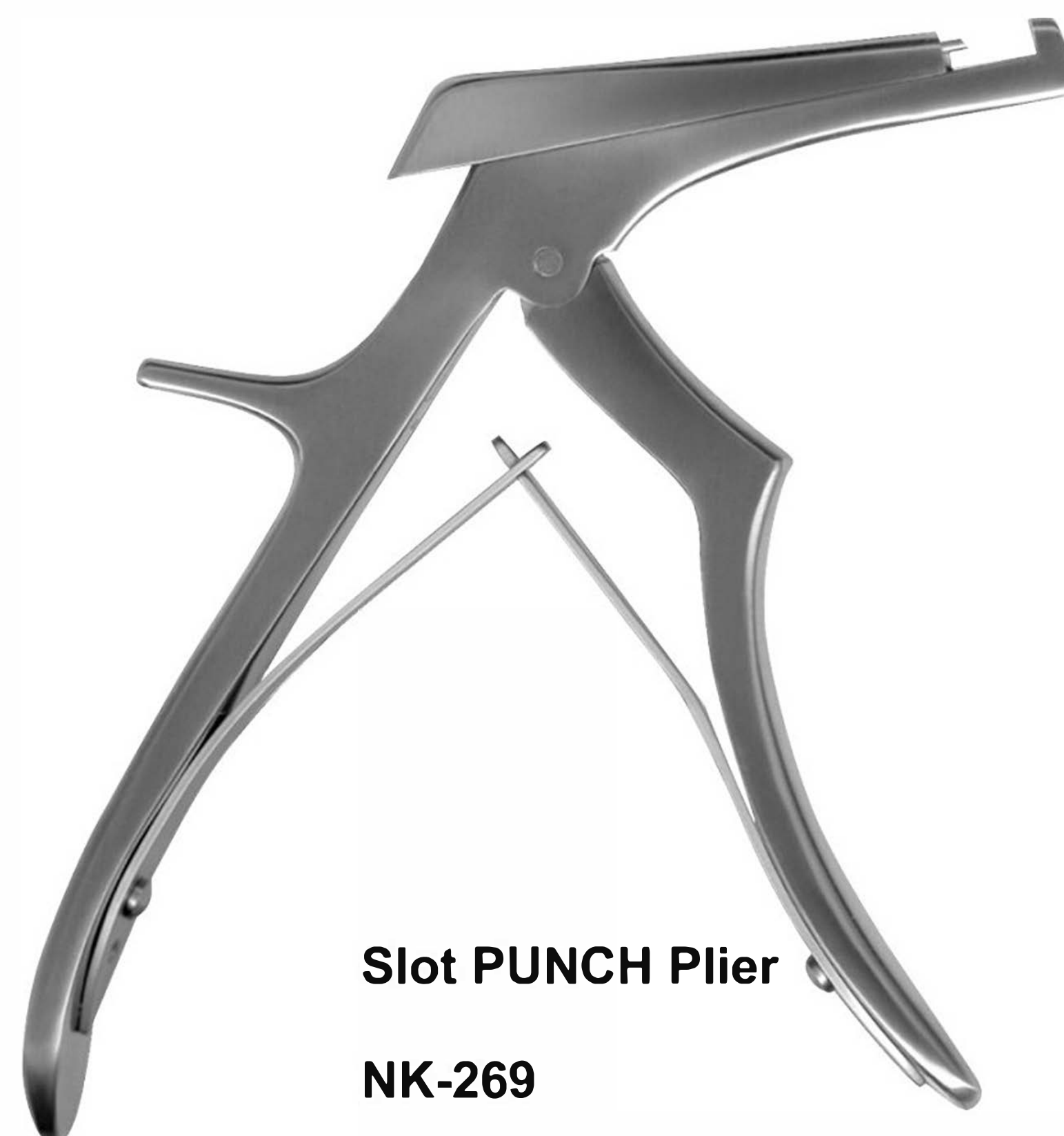
Slot PUNCH Plier NK-269