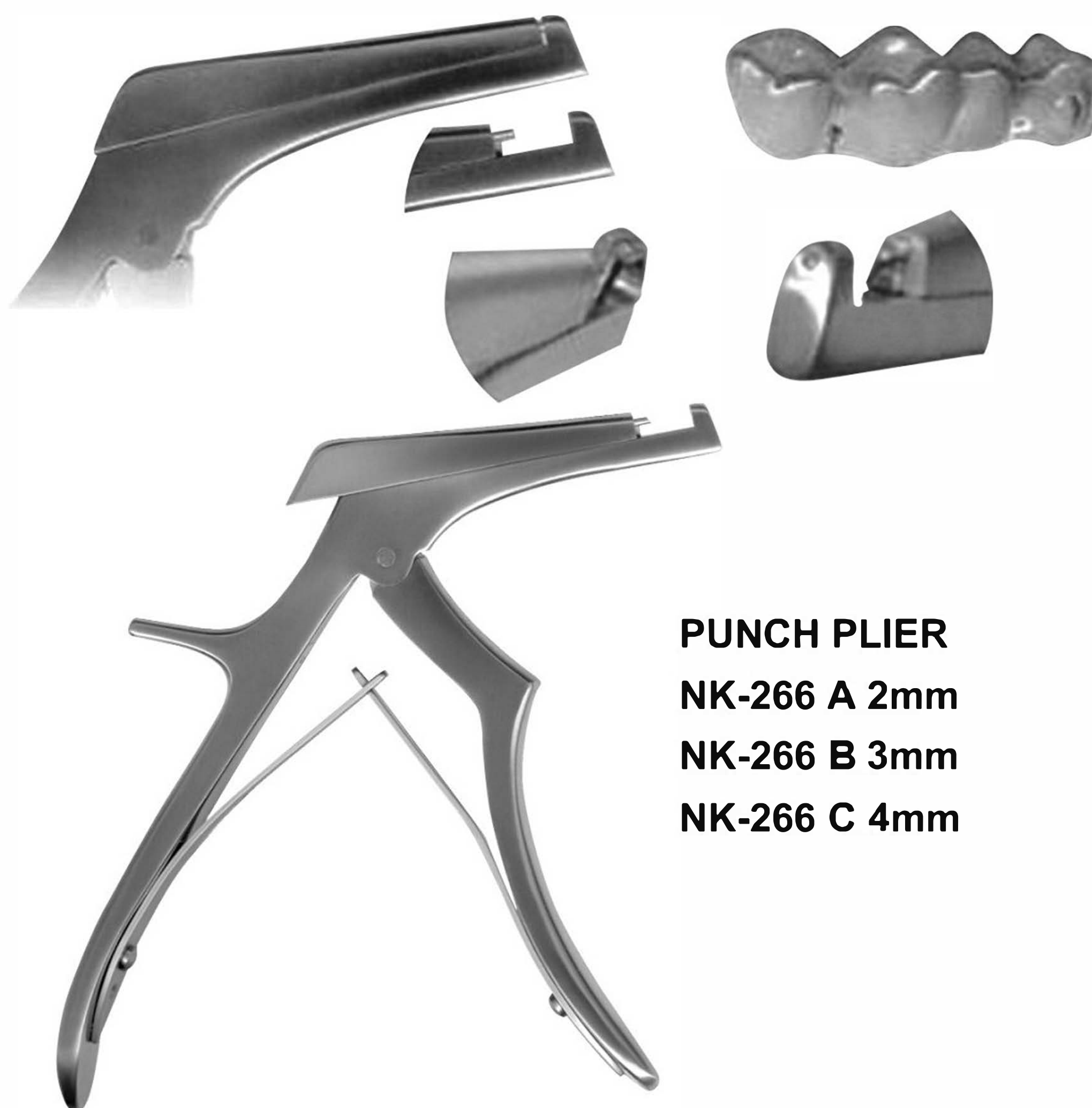
PUNCH PLIER NK-266 A 2mm NK-266 B 3mm NK-266 C 4mm