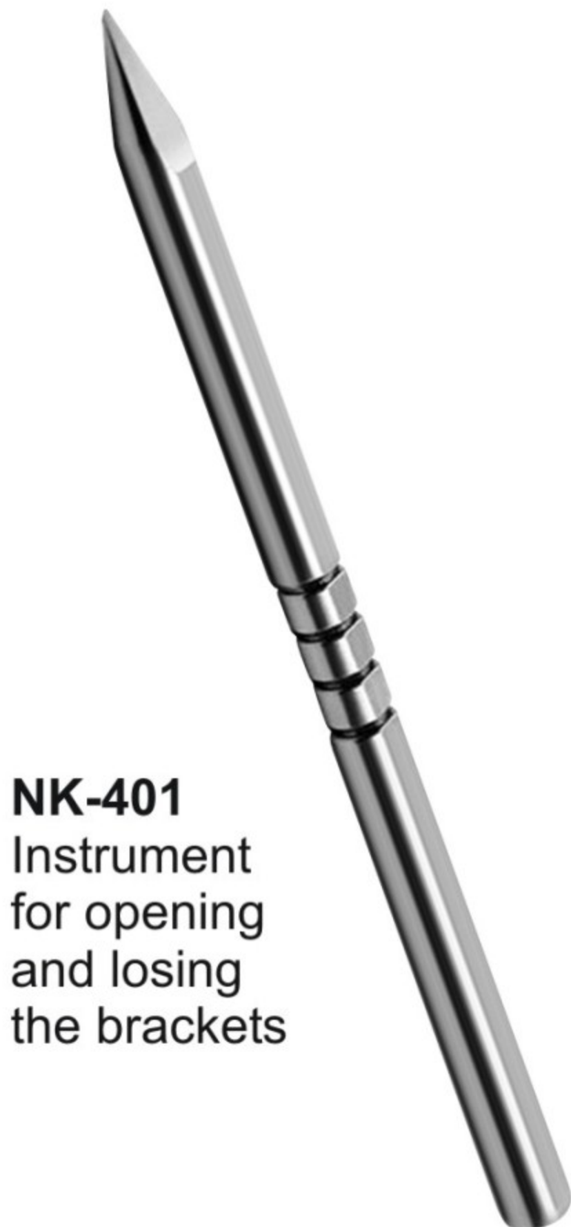
NK-401 Instrument for opening and losing the brackets